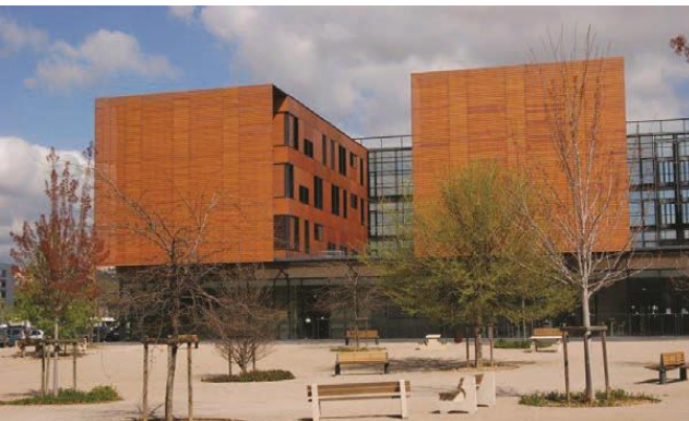
ISFA – Gerland Campus