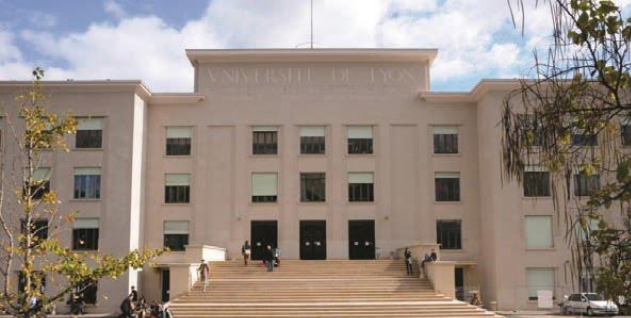
Faculty of Medicine Lyon Est