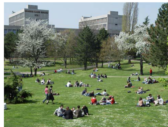
Crédits photos : © Service Communication – Eric LeRoux / UCBL, sauf (*)