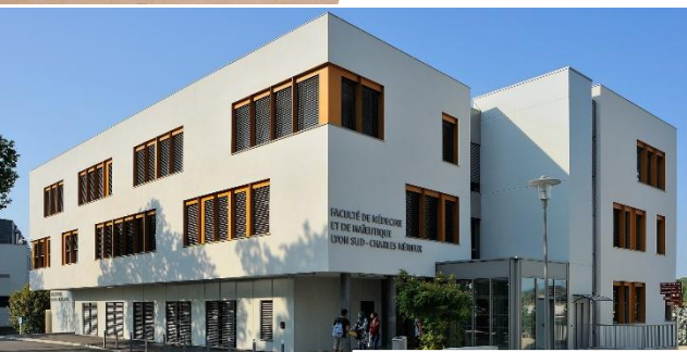
Faculty of Medicine Lyon Sud