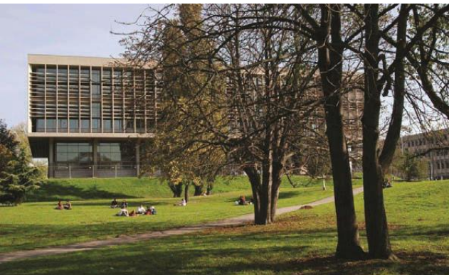
Lyon Tech la Doua Campus